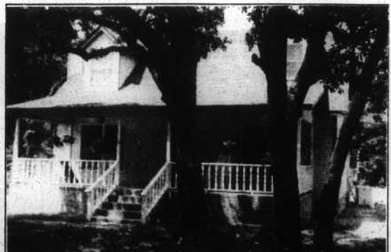
1804 W. OAK ISLAND DRIVE. This 3-bedroom, 2-bath home welcomes you with its open floor space. Large country porch invites you to come sit and relax. The living area has hardwood flooring and a brick fireplace. $84,500.