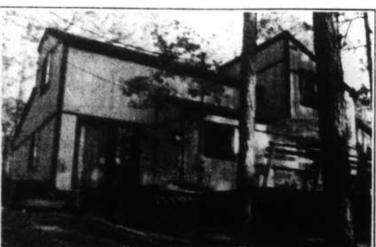
146 FOREST LANE, Boiling Spring Lakes. 3-bedroom, 2-bath home with fireplace has excellent floor plan on two spacious and private lots. Beautiful deck goes across entire back part of house. $84,900.