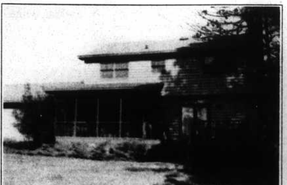
42 AUGUSTA DRIVE. Gracious 4-bedroom, 2 1/2-bath home on Oak Island golf course. Custom cabinets with undercounter lighting. Living room, family room with fireplace, plus office. Screened porch and deck. Sprinkler system. An ideal family home. $139,900.