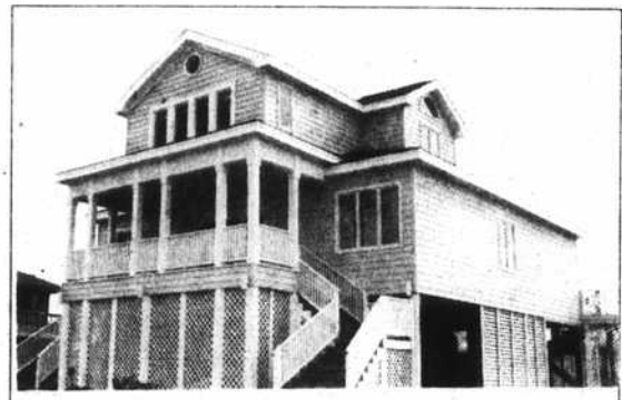
6327 KING'S LYNN DRIVE. Compromise no more! This ocean and sound view 4-bedroom, 3-bath home with dining room, 27'x15' living room and two fireplaces features exquisitely planned quality details to enhance your life! $214,500.