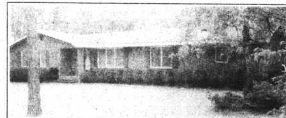
509 E. LEONARD STREET. Large brick 3-bedroom, 2-bath home with great floor plan. Family room with fireplace provides plenty of space for recreation. Large attractive yard with boat shed in rear. $92,000.

The frost is on the pumpkin... but you can be warm and cozy by the fire!