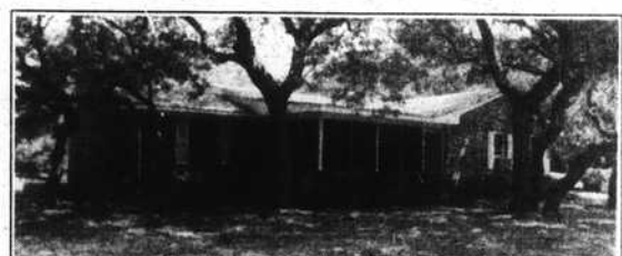
106 THROCKMORTON STREET. Beautiful live oak shaded lot with walk to the beach location! This 3-bedroom, 2-bath brick home with screened porch, large living room and fireplace has great potential. See today! $82,500.