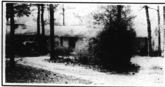
795 S. SHORE DRIVE: Enjoy the Big Lake from the 12x40' screened porch, 3 bedrooms, den. $110,000.