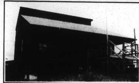
1623 E. BEACH DRIVE. "Polaris" is located on one of the deepest oceanfront lots on the island. This lovely two-story, 4-bedroom home with second level loft is nicely furnished. Walkway over the dunes, plus an oceanside gazebo. Over $14,500 in rental income! REDUCED, $167,500.