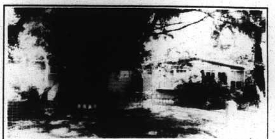
208 REDWOOD DRIVE: Very attractive inside and out, workshop, shed, three lots. $40,000.