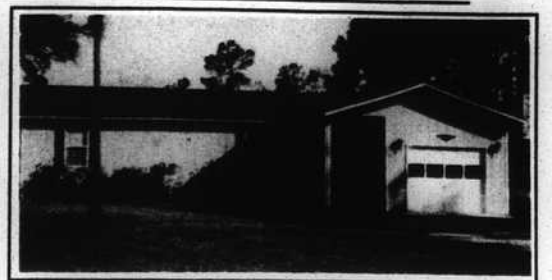
943 N. SHORE DRIVE: 3 bedrooms, 2 baths with great floor plan, on the Big Lake. $82,000.