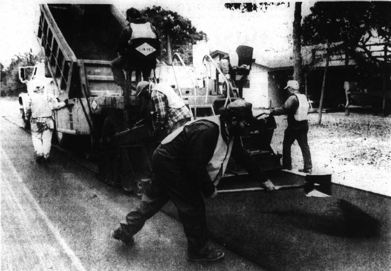
Work continues on resurfacing of some 28 Long Beach streets, as well as initial paving work on 8th NE, 14th NE, 36th NE, 42nd SE streets. This crew was operating just east of Middleton Street on Friday afternoon.