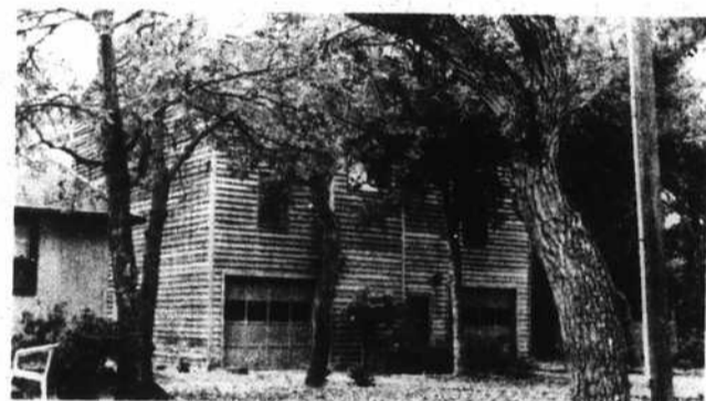
105-10th STREET SW

•300 Caswell Beach Road. The new 11,000-square-foot Oak Island Coast Guard Station was dedicated in May and cost approximately $3 million to complete. The building was designed to blend with the local environment and reflect a modern-day adaptation of an old Coast Guard station. The station is included as a bonus on the Oak Island Tour of Homes. It is regularly open to the public at no charge.