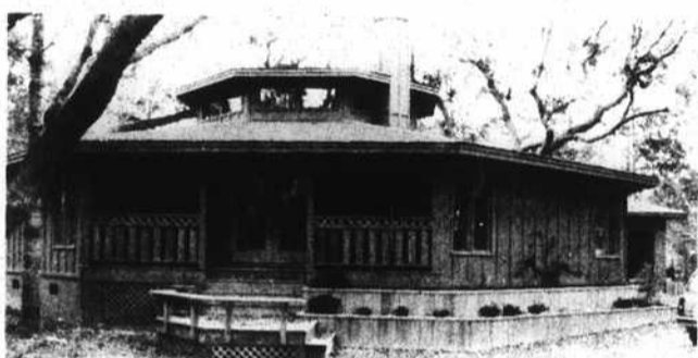
110-8th STREET SW

•105-10th Street SW, Long Beach. The home of