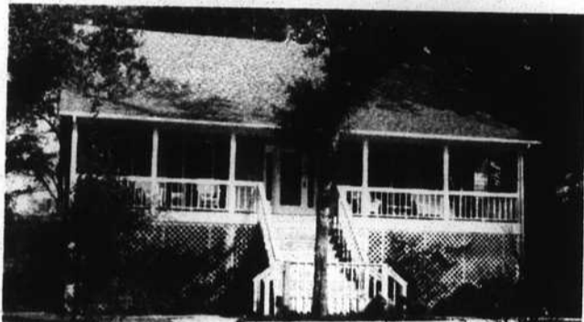
2406 EAST YACHT DRIVE