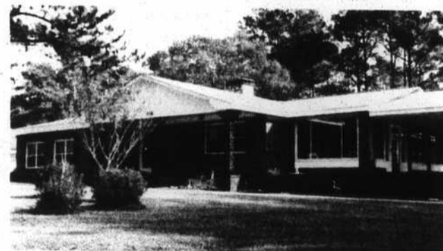
308-58th STREET NE