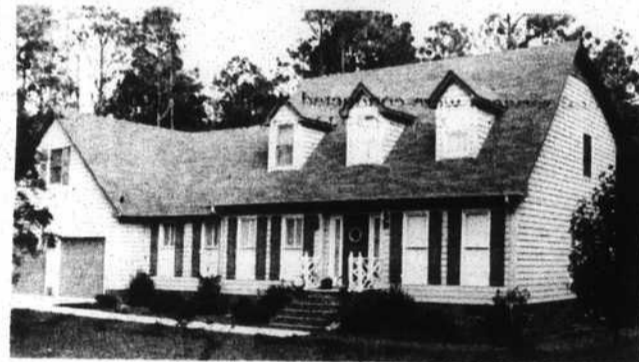
400 PALMETTO DRIVE