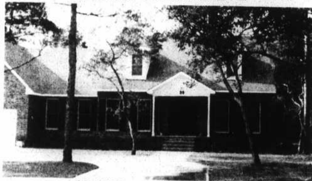
38 AUGUSTA DRIVE