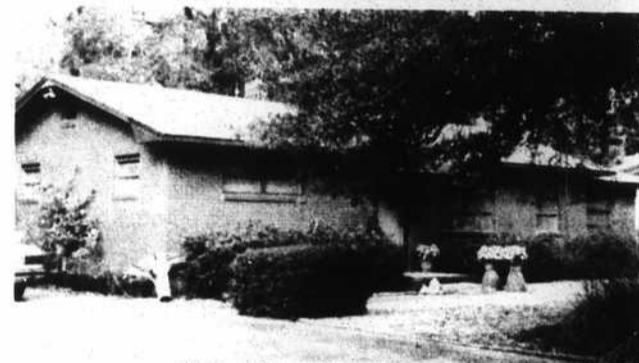
105-40th STREET NE