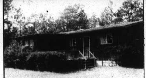
528 NORTH SHORE DRIVE. Over an acre with 180' frontage on Big Lake, opposite the country club. Roomy 3-bedroom, 2-bath ranch, Florida room and double garage. $112,000.