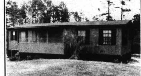
1221 LEXINGTON ROAD. Custom-made Horton doublewide, extensive upgrades. Built 1991. Near schools and swimming area. Three-seasons porch. Nice floor plan. $38,900.

*1090 MIRROR LAKE DRIVE. A "steal" at $16,400! Quality 3-bedroom, 1 1/2-bath mobile home in excellent condition. Fully furnished. Finest location. Possible owner financing.