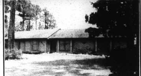
825 EDEN DRIVE. 4 bedrooms, 3 baths, great room and much more in this 2,600 sq. ft. ranch. Auto sprinkler maintains lush landscaped triple lot. $125,000.