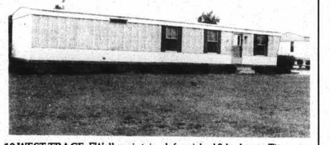
10 WEST TRACE. FWell-maintained, furnished 2-bedroom Titan mobile home on large landscaped lot. Quiet family neighborhood, 3/4-mile to shopping. Split-rail side fencing in front, chainlink in rear with 12x14' deck. Outside storage building. $31,500.

919-457-5258 • 919-278-5213 800-733-5258 • 800-733-5213