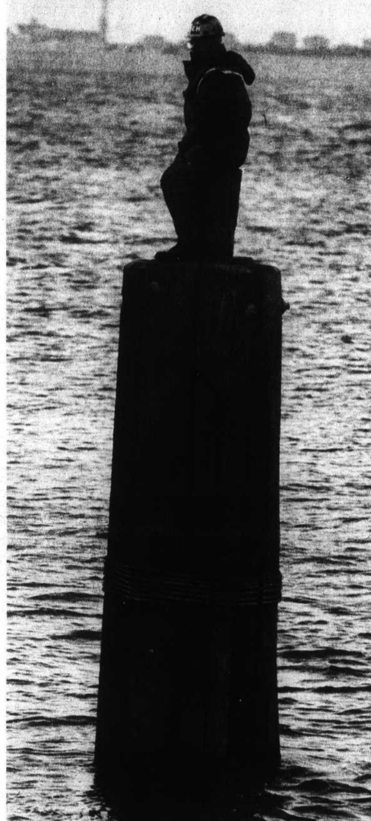
Sitting on a dolphin, watching his ship steam away, this Coast Guard line-handler is hopeful that a small boat is on its way back for him after he helped cast off during a recent visit to the Southport city pier.