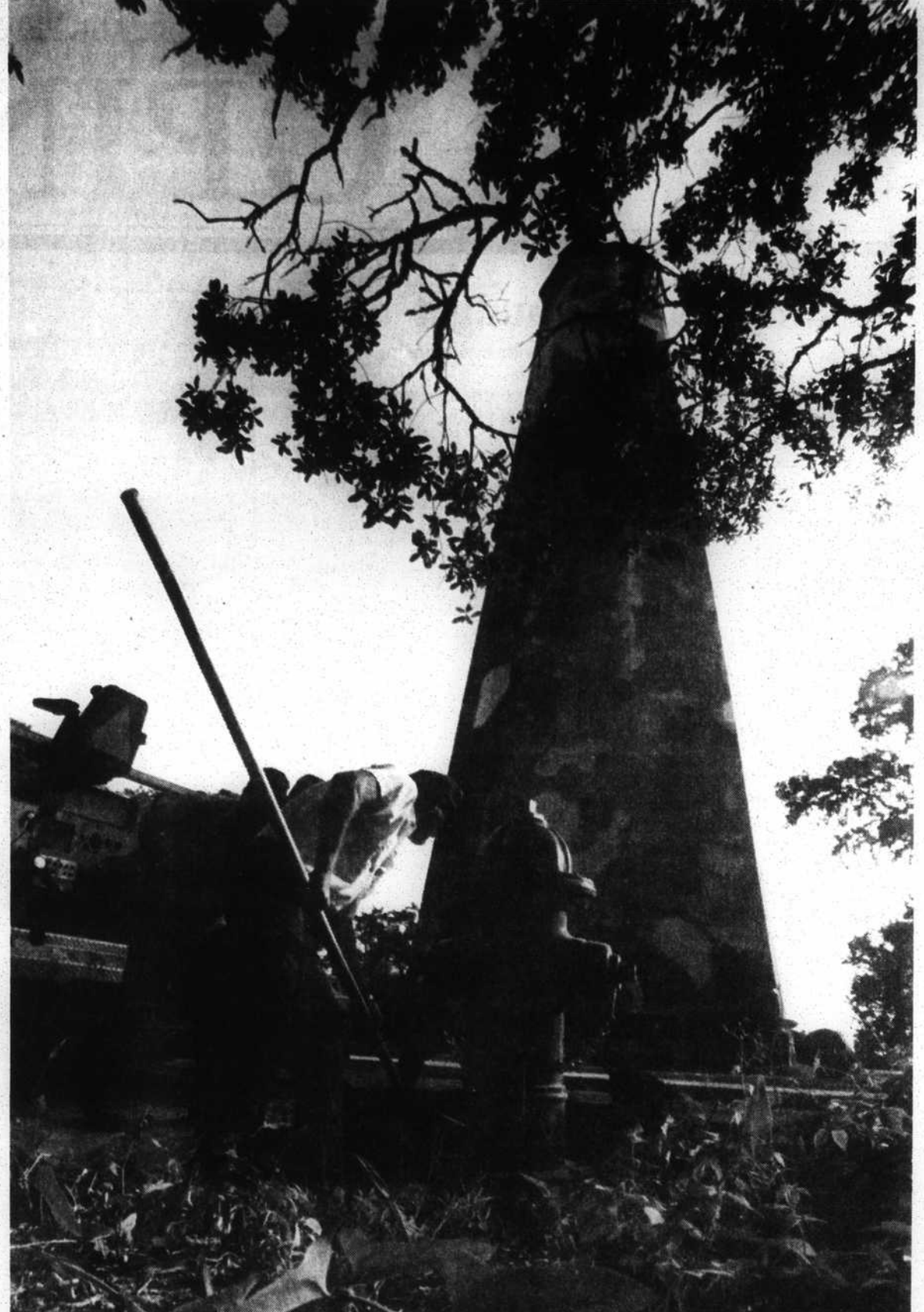
Paving crews that completed their project around the Bald Head lighthouse last week are now at work

The board of education has scheduled another meeting at 6:30 p.m. Wednesday (today) at the central office to further discuss personnel matters.