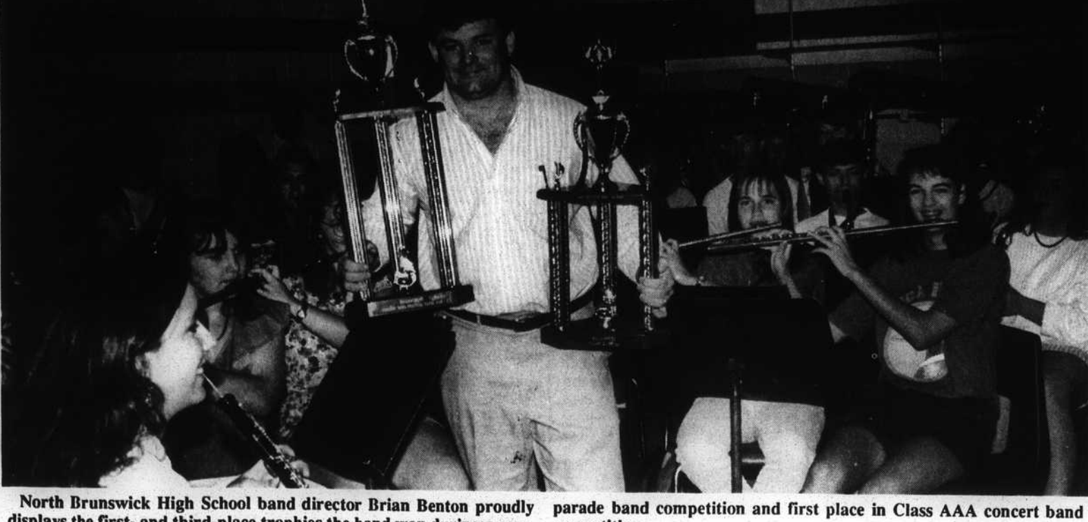
displays the first- and third-place trophies the band won during a competition in Williamsburg, Va. The band took third place in Class AA