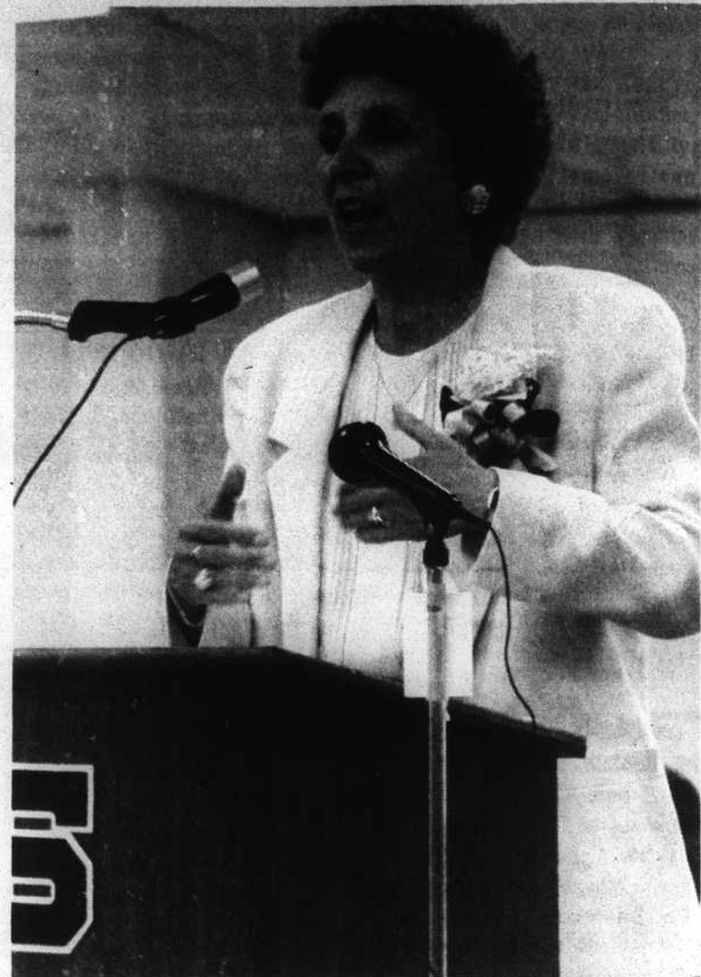
Cougar athletes never paid better attention to a coach than on Friday, when Kay Yow, women's basketball coach at N. C. State, spoke at the South Brunswick athletic awards ceremony.