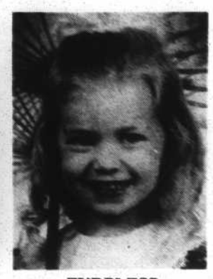
Tiny, Little Miss pageants this Saturday night

The 17th annual Tiny and Little Miss N. C. Fourth of July Pageant will be held at 7 p.m. Saturday, June 19, at South Brunswick High School.