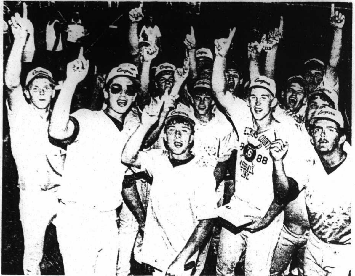
Five years ago this week the South Brunswick Cougars won the state 2A baseball championship, thrilling the entire community. It was the first state title -- in golf -- this year.