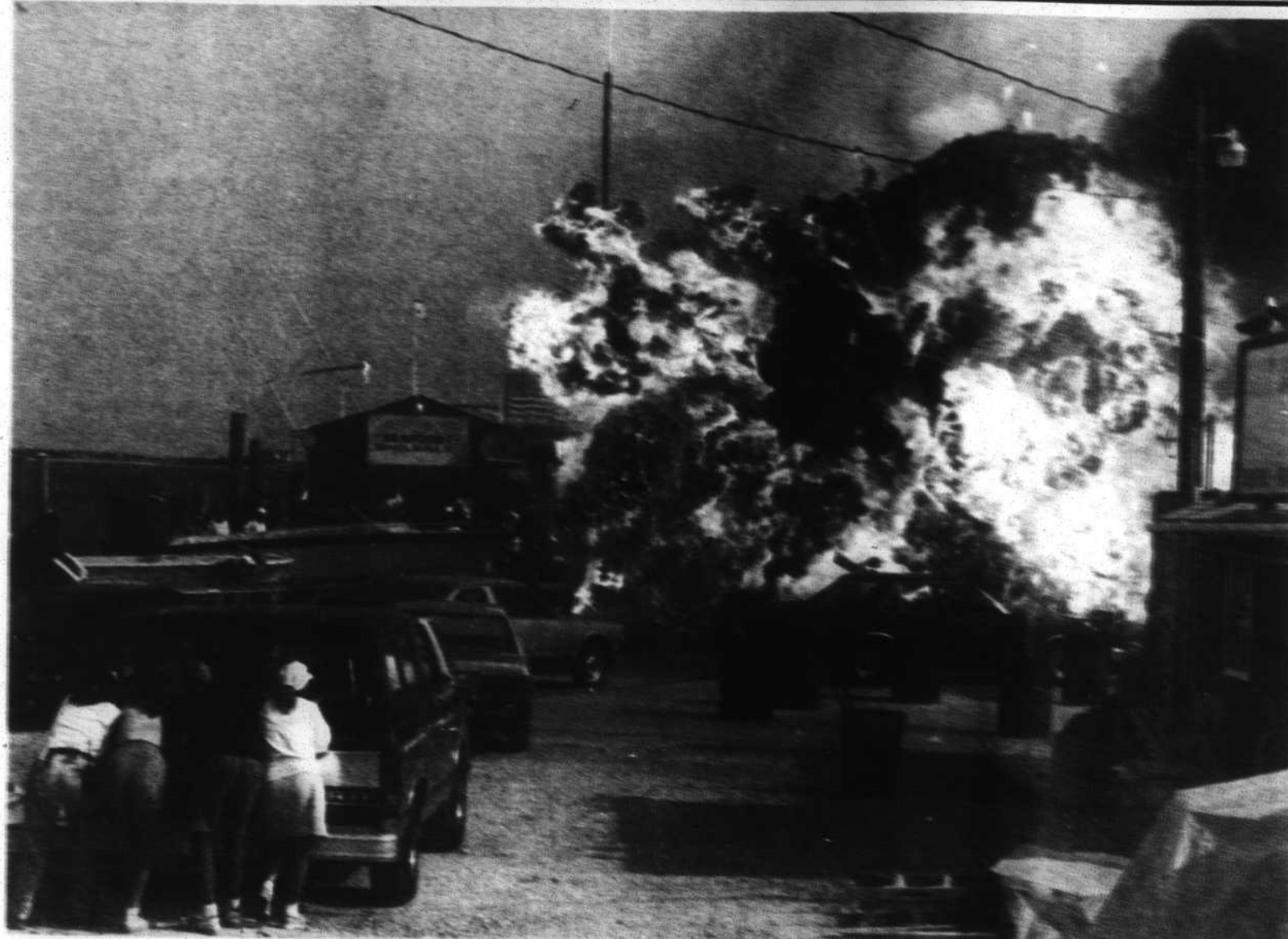
A whopping explosion and fireball punctuated filming of "Birds II" at the Southport yacht basin last Thursday. The crew took shelter during the episode and firefighters stood by to make sure the stunning pyrotechnics did not get out of hand. Local filming is now completed.