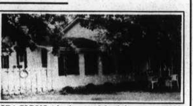
SPACIOUS 4-bedroom, 2-bath home on TWO LOTS with most furnishings included. Woodstove, porch and utility room. $71,500. Long Beach.