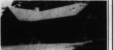
5802 E. YACHT DRIVE. Spacious 4-bedroom, 2-bath brick/frame home with large deck on a deep corner lot. Owner will consider adding dock for buyer. Please call for details.