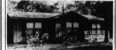
2-2-2! Well-kept 2-bedroom, 2-full-bath home located on 2 lots. Freshly painted inside, sky-lights, Florida room, outside storage and more all add to this home on quiet west end for only $74,000.