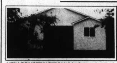
NEW CONSTRUCTION! 3-bedroom, 2 1/2-bath home with tile and carpet, storage under, deck and more. This is a must see at only $84,500. 101 NE 28th Street.

ART SKIPPER REALTY, INC. 112 Country Club Drive, Yaupon Beach, NC 28465 910-278-6730 • 910-278-7022