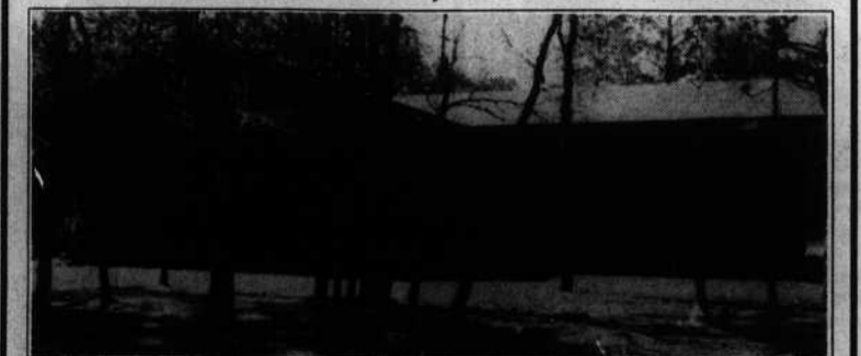
3-bedroom, 2 1/2-bath home on the 11th fairway. 1,420 sq. ft. plus a 12x14' unheated Florida room with window air. 10x12' building. Oversized one-car garage and fenced backyard. Priced in the $70's.

484 Palmer Drive On Golf Course, Price Reduced