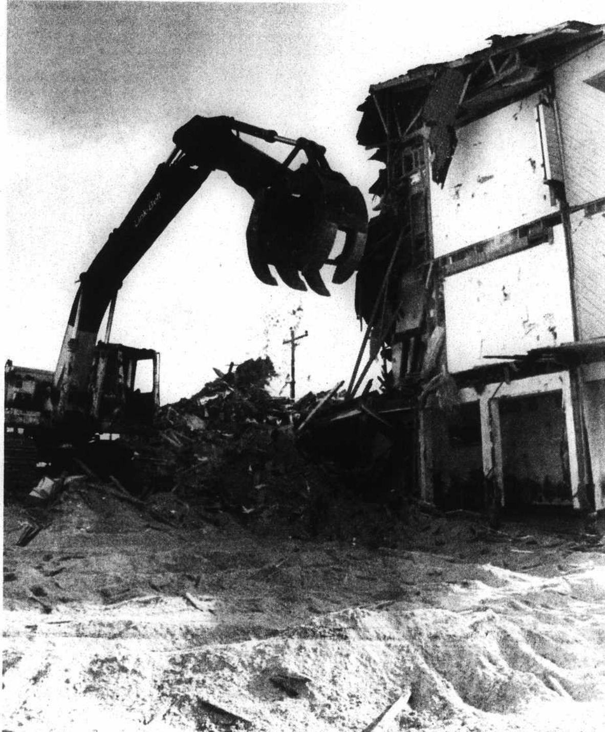
One of Long Beach's most distinctive architectural features -- and a benchmark for the vagaries of beach erosion -- went under the wrecker's claw last week, ending long speculation about whether the structure would be moved. The 11-unit Sea Horse Apartments just east of the cabana had been under condemnation and vacant since February, 1994.

The following adjustments should be made: Bald Head Island, high -10, low -7; Caswell Beach, high -5, low -1; Southport, high +7, low +15; Lockwood Folly, high -22, low -8.