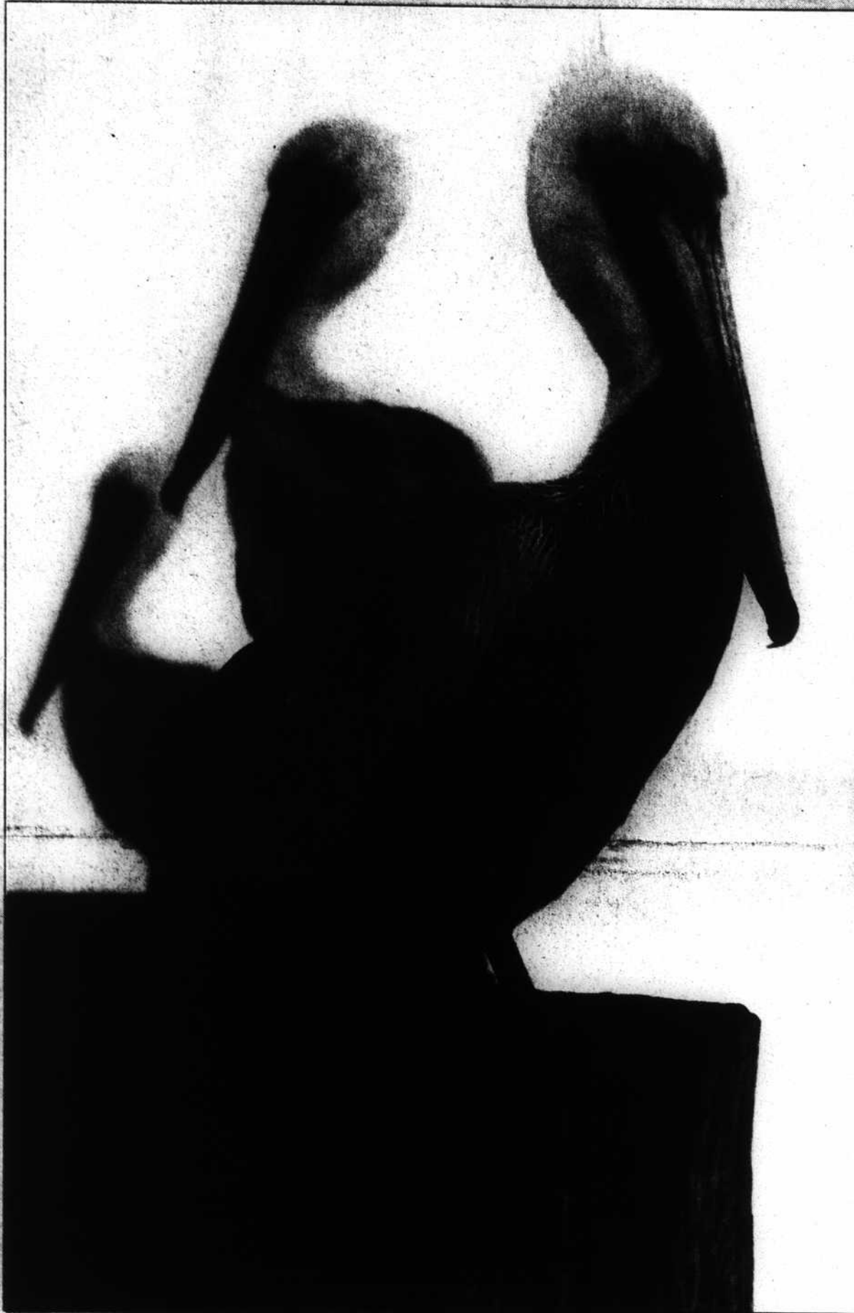
Colorful and still in full bloom along the Southport waterfront this week are pelicans, but soon they will find themselves drawn to nesting areas upriver and to sea as feeding opportunities improve.