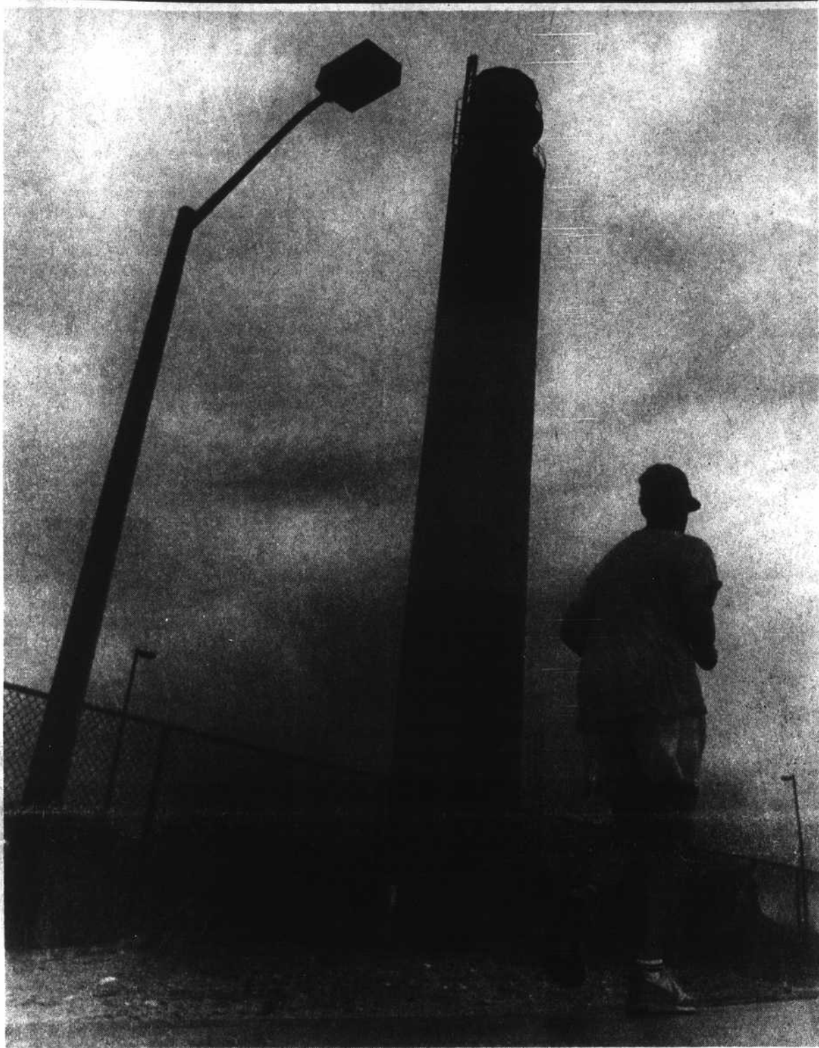
Looming large on the Caswell Beach skyline these days are new streetlamp poles, Oak Island lighthouse and joggers at dawn, but notably absent are the old wooden poles that used to support power lines, telephone wires and television cable. These were finally removed last week, marking a successful end to undergrounding of the unsightly and vulnerable roadside wires which began in 1992.