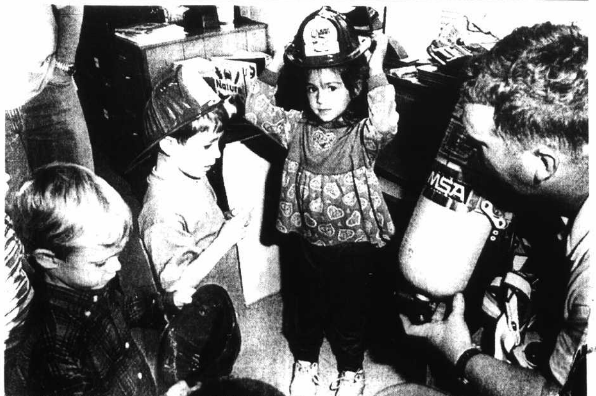
Members of the Southport and Military Ocean Terminal Sunny Point fire departments discuss fire prevention at the Southport Baptist Church Lay School during Fire Prevention Week. Educational program conducted at South Brunswick Middle School, the Montessori school and Southport Elementary.