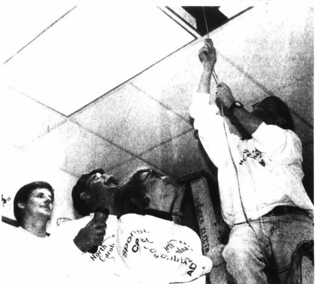
Net Day '96 volunteers at Southport Elementary School run fiber-optic cable through the ceiling to wire 22 classrooms for Internet access. Nine schools in the county participated in the statewide effort Saturday.