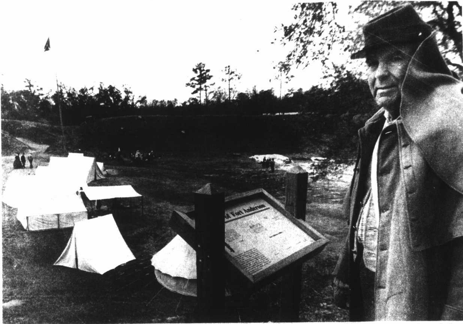
The Department of Cultural Resources over the weekend sponsored a Living History Encampment as part of the Civil War Program at the Brunswick Town/Fort Anderson state historic site. Guns were fired,

campaigns were explained and in some cases fantasies were played out. More photos in the Neighbors section.