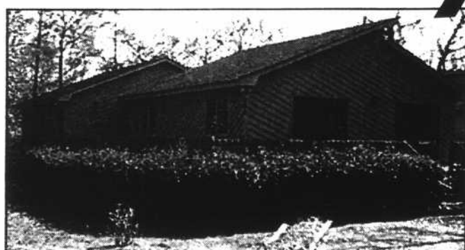
2903 E. OAK ISLAND DRIVE - NEW LISTING! Beautiful contemporary home in attractive neighborhood. Large lot insures privacy & garage provides storage & workshop. $110,000.