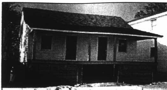
116 BAY STREET - NEW LISTING! What everyone is waiting for is finally here! This 3-bedroom home will have a fantastic river view! Under construction. Buy now & choose decor. $364,900.