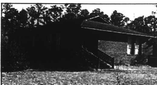
1 W. SOUTH SHORE DRIVE - NEW LISTING! Brick home situated on large corner lot near big lake & golf course. Gazebo & attached garage. $89,900.