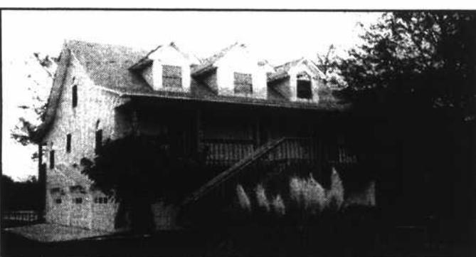
2002 E. YACHT DRIVE - REDUCED! Lovely home on waterway with pier, 3-bay garage, beautiful wood floors in living area, lots of windows & storage. Light & airy, luxurious living. $249,900.