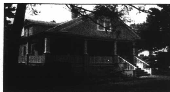
114 W. NASH STREET - NEW LISTING! 3-bedroom, 3-bath home lovingly restored & maintained in a wonderful neighborhood & close to everything. $225,000.