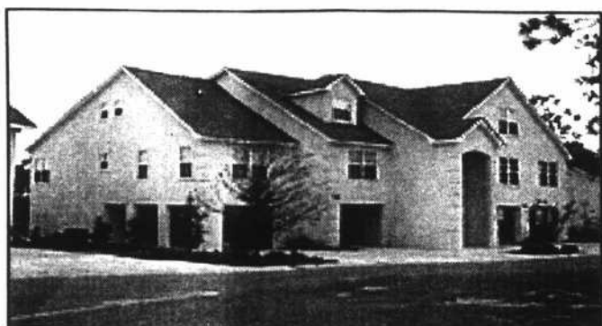
3125 LAKESIDE COMMONS DR. SE - GREAT AMENITIES St. James Plantation. A distinctive residence with spectacular views in walking distance of the clubhouse, pool & tennis courts. $244,900.