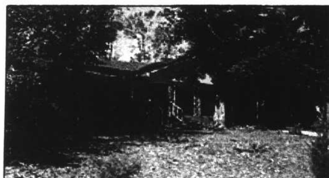
107 SE 29th STREET - REDUCED! Custom-built home on two lots. Two-car garage, fenced yard & lots of extras. Call for details. $159,900.