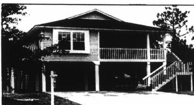
157 NE 12th STREET - NEW CONSTRUCTION! Great value in this new construction, 3-bedroom, 2-bath with fireplace, ceiling fan, ample closets, large storage, paved parking & drive. $92,500.