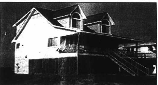
3330 W. BEACH DRIVE - REDUCED! Beautiful 2nd row home on high corner with ocean & sound views from every room. Vinyl siding & large covered porch for catching breezes. $239,000.