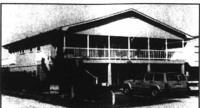
135 CHARLOTTE STREET - NEW LISTING! 4-bedroom, 3-bath house on canal with dock. Comfortable living with Nautical views. $197,600.