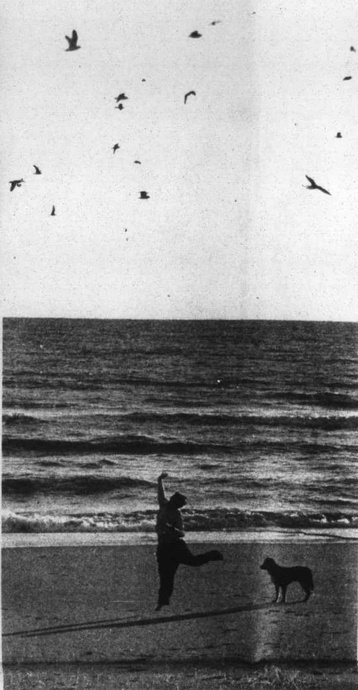
You might call it art -- a virtual arabesque at the water's edge -- but in reality it was a matter of good, athletic follow-through as the young lady on the Long Beach strand had to toss bird food high