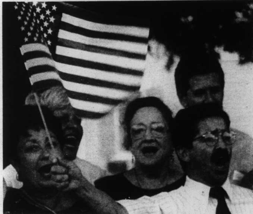
Southport remembers the true meaning of Independence Day