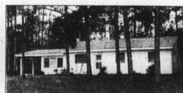
205 NE 54 th STREET, 2-bedroom, 1-bath home on beautiful lots. Screened porch. Great location. Will trade for lots. $75,000.