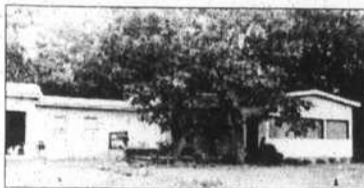
120 NW 3 rd STREET, 2-bedroom, 2-bath home on two lots. Double garage with one oversized door for boat storage. Remodeled in 1992. $117,900.