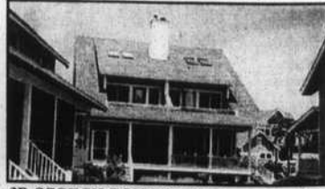
3B SCOTCH BONNET, 3-bedroom, 2 1/2-bath oceanfront home. Professionally decorated. Walk out your boardwalk to the beach. Convenient to golf and tennis. Jack Cox, 457-6884. $399,000.

HOMESITES AVAILABLE: Other oceanfront, golf course and forest lots from $45,000 to $630,000. For more details contact Jack Cox at 457-6884 or Pam Lawrence at 457-1120.