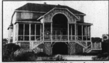
819-B KILLEGRAY RIDGE, Oceanfront condo. 3 bedrooms, 2 1/2 baths, large deck and porch. Reverse plan offers the ultimate views of Bald Head Island beaches. A must for you to see before buying! Jack Cox, 457-6884. $460,000.