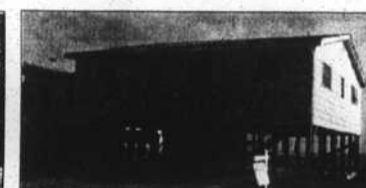
4932 EAST BEACH, OCEANFRONT HOME, 4-bedroom, 2-bath home on pilings, heat pump, furnished, screen porch, large great room. $105,000.