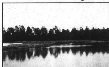
WILD PINE COURT, Winding River Plantation. Beautiful homesite overlooking #2 fairway of Fred Couples' Signature Carolina National Golf Course with view of lake in Winding River Plantation. Paved/curbed streets and utilities are in place ready to build home of your dreams.