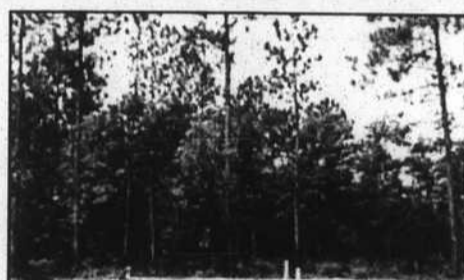
HEATHER RUN, Winding River Plantation. Beautifully wooded homesite on cul-de-sac in prestigious Winding River Plantation golf community. Paved/curbed streets and utilities are in place. Gorgeous homesite.

The Most Beautiful Land in Brunswick County is Not For Sale... (YET.)