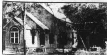
2004 Pete's Camp Road, Smithville Woods. A custom home.

Please call us for consultation on your new custom home construction.