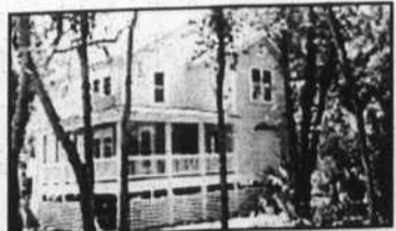
15 PEPPERVINE TRAIL, Oceanfront home for sale as 1/2 undivided partnership. 3-bedroom, 3-bath with convertible room. Great rental property. $250,000. Jack Cox, 457-6884.