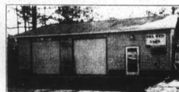
4672 LONG BEACH ROAD, 1200 sq. ft. building on one acre. Septic system, located in good traffic area. Priced at $200,000.