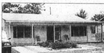
145 NW 6 th STREET, Well maintained 3-bedroom, 2-bath, vinyl siding, fenced back yard, covered front porch. ONLY $89,500.