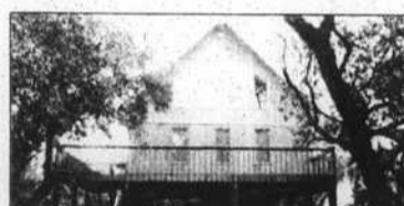
144 NW 8 th STREET, 2-bedroom, 2-bath home on pilings, heat pump, utility storage room, beautiful trees. $89,900.

6101 E. Oak Island Drive Long Beach, NC 28465 910-278-5469