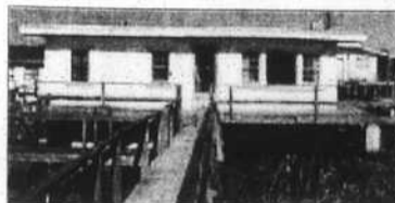
2213 EAST BEACH, Oceanfront duplex on nice lot. REDUCED to $99,900.