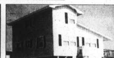
2625 EAST BEACH, Oceanfront home with 4 bedrooms, 2 baths, furnished. Excellent rental history. $159,900.