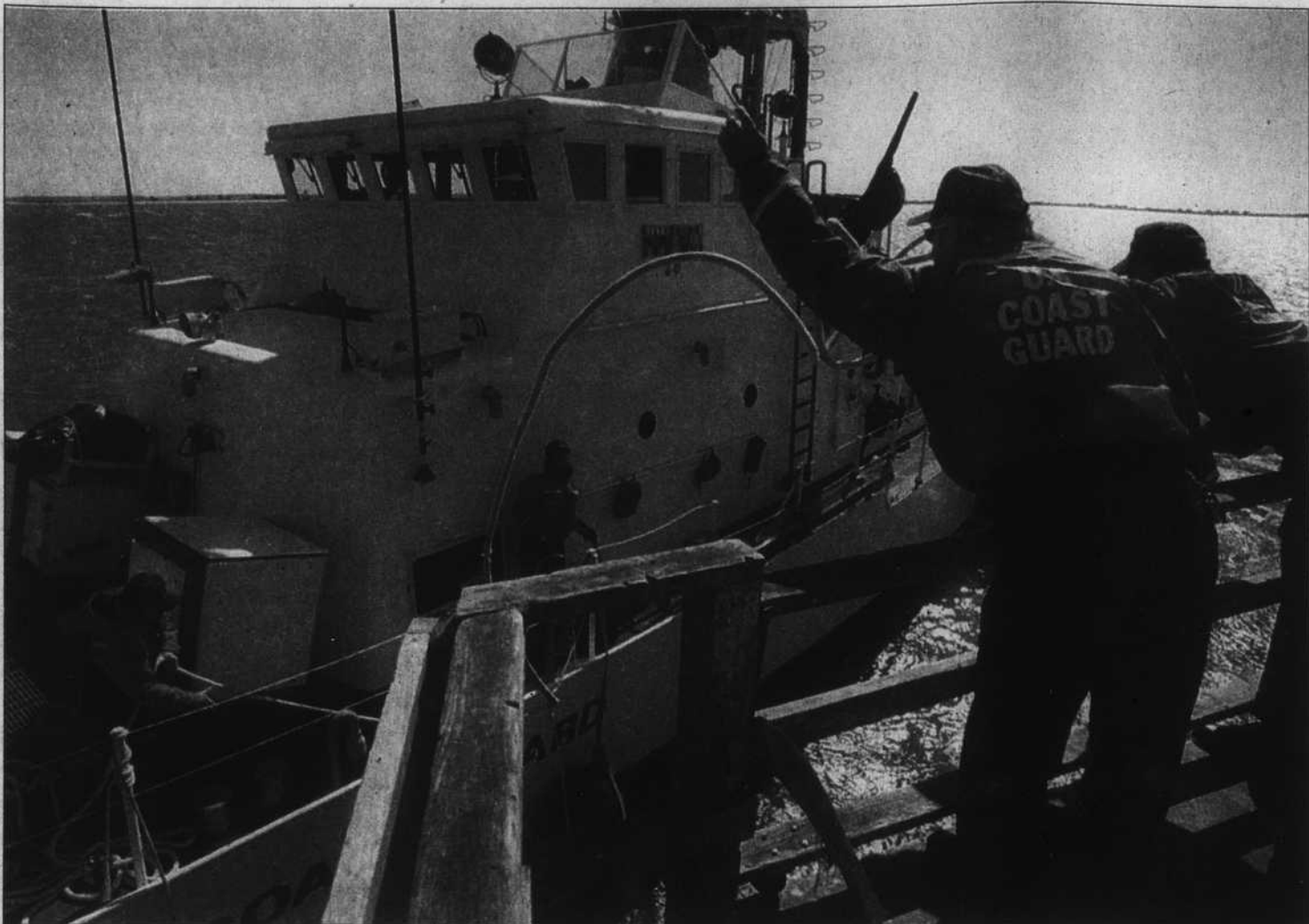
The last line is cast off and the Coast Guard 110-footer Staten Island is underway after an overnight stop at the Southport city pier. Cutters and buoy tenders are periodic visitors here, giving residents and visitors alike an opportunity to see an ocean-going craft up close.