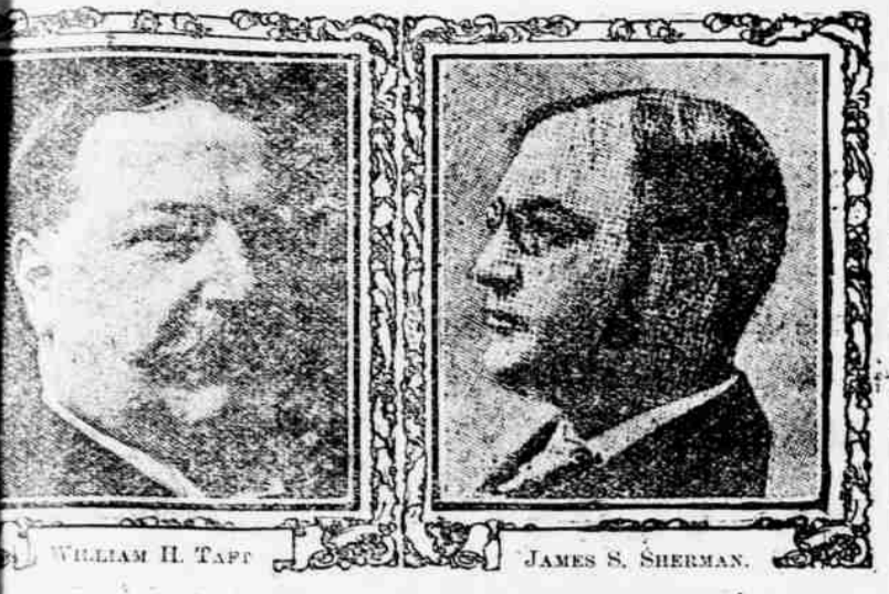
For President: William Howard Taft, of Ohio For Vice-President: James S. Sherman, of New York