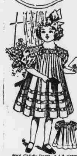
5965 Child's Dress, 2-4-6 years. For the four-year size will be required 2 1/2 yards of material, 2 1/2 yards 2 1/2 or 2 3/4 yards 2 1/2 or 2 3/4 yards of binding and 2 1/2 yards of lining.