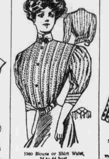
5960 Blouse or Shirt Waist, 34 to 44 bust. The quantity of material required for the medium size is 4 yards 21 or 24, 2 1/2 yards 22 or 24 yards 44 inches wide.