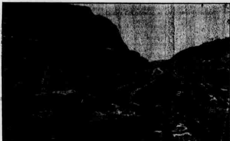
THE FAMOUS CULEBRA CUT. An Old French Excavation.