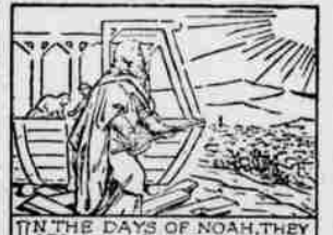
IN THE DAYS OF NOAH, THEY LAKE THEY PLANTED, THEY BUILT, AND KNEW NOT

The day and the hour of the great change no one knew; not even the angels in heaven. The Master himself declared that he did not know—but