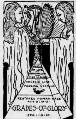
RESTORED HUMAN RACE ACTS 3:19-21. GRADES OF GLORY. Eph. 1:2-10.

have attained the necessary character likeness of Christ and will have stood the necessary testings. As no one of the Jewish priests could ever serve as High Priest if he had a superfluous finger or toe, it is thus shown in the type that the antitypical High Priest, the Messiah, will have only a definite, fixed number of members in his Body—neither one too few nor one too many. Later on, the foolish Virgins came to the "door," but found it forever shut. They lost the great prize. They were foolish in that they did not give attention to getting the oil in time; foolish also in that they cared too much for the things of this present life; but they were Virgins, nevertheless. They finally got the oil, which represents the holy Spirit, but too late! The door was shut! They could not be of the Bride class. The Master answered, I know you my friend, I could not recognize you as my Bride.