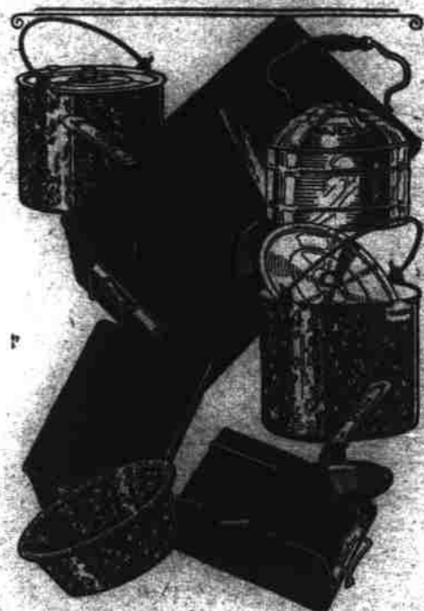
The Good Wife Deserves a New Majestic Range in her Kitchen

It lessens her work and worry. Its exquisite beauty, great water heating and baking qualities give joy and happiness to the whole family, three times a day, every day in the year, for years and years to come. Certainly this is worth considering when you know the Majestic costs less per year than any other range on earth.