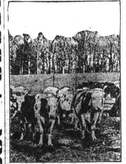
Officially Accredited as Free From Tuberculosis.

There is always a chance that one tiseased animal in a community may contaminate others. It may come in contact with them at fence lines and by going to other farms; or the disease may be spread by its drinking at running streams passing through neighboring pastures. The feeling expressed also is that the disease cannot be kept under control, much less eradicated, if these animals are omitted in the clean-up of any territory. Whole areas, therefore, like townships and counties, should be cleaned up rather than scattered herds, if the work is to