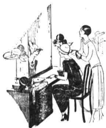
You have never seen the cloche in so many attractive variations. You will find them in the millinery section and in the French Room in endless variety of color, shape and material.

TAILORED SUITS: stronger in fashion than for years! Tweed or dark wool; many in mannish "hair-line" cloths, Boyish types. HAND-DRAWN LINEN FROCKS: in white and all the high colors. FLANNEL FROCKS: in high colors, or in smartly checked or striped effects on gray and tan. MONOGRAMS: which are everywhere on scarfs, frocks, ties, blouses, sweaters—even hats! FOR ORNAMENTS: gleaming little decorations to pin to the pockets of tailored suits—as popular as white gardenias on lapels! SHORTER SKIRTS: several inches above last year's! FOX SCARFS: again for spring, smartest of fur neckpieces.