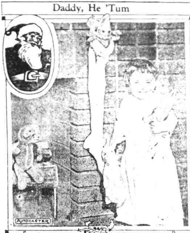
Daddy, He 'Tum

"Take heed to remember, those of you who by eminent success may rise yourselves beyond your peers, that it behooves you to do all you can to make your position as little 'jarring' as possible to that immense majority whom fate has not singled out for its favors. Try always to