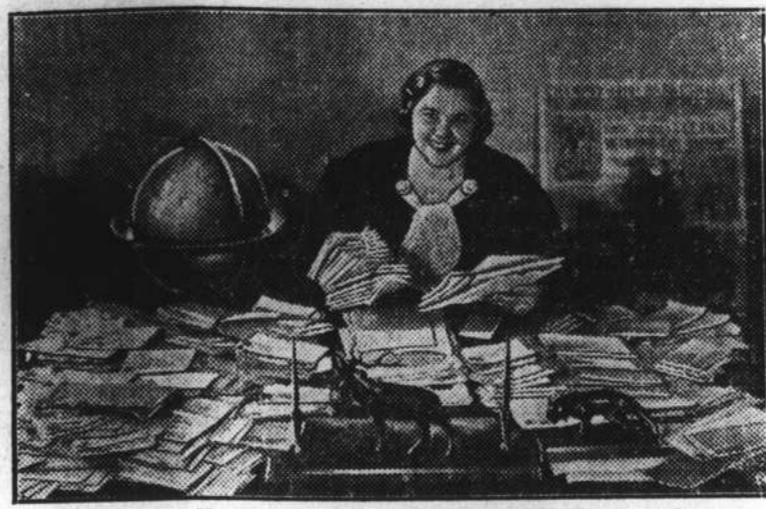
KATE SMITH, WITH FAN MAIL