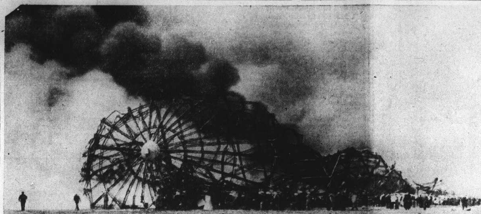
Only seconds after the first hint of disaster, the Hindenburg is an inferno, its flame resisting steel ribs starkly outlined by the brilliant light of clouds of burning hydrogen as would-be rescuers stand helplessly by. About half of the 100 passengers and crew aboard were believed to have died. Pictures of the disaster were flown to New York by American Air Lines.