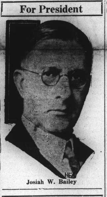
Josiah W. Bailey

Columbia, S. C., Aug. 26.—(AP)—A stack of letters from South Carolina farmers complaining of cotton-handling by co-ops were read into the record today as hearings before the special legislative commission got under way.