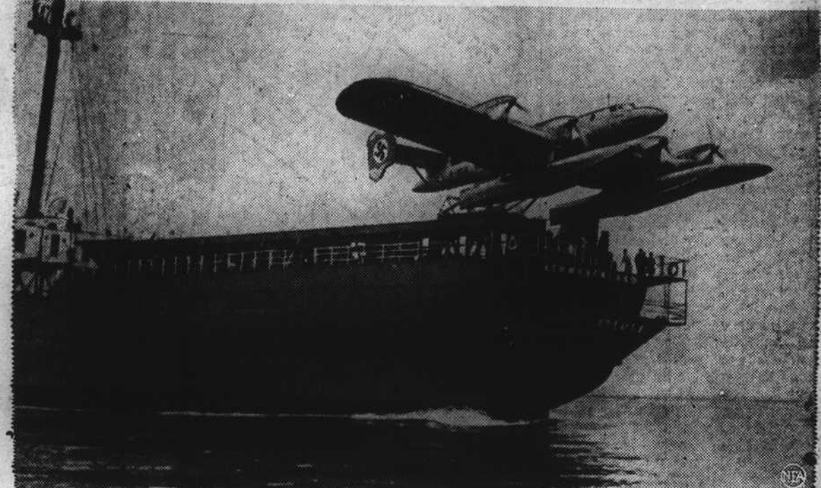
The catapult ship Schwabenland is the Nazi answer to the uncertainties of the take-off for the flying boats used in survey flights along the Azores route across the Atlantic. The gigantic four-motored Nordmeer, above, was launched in full flight from the mother ship at Port Washington, L. I., for the return flight to Germany. Mounted on a special undercarriage, the plane can be launched from a standstill start at 95 miles an hour in the two-second run along the steel track.