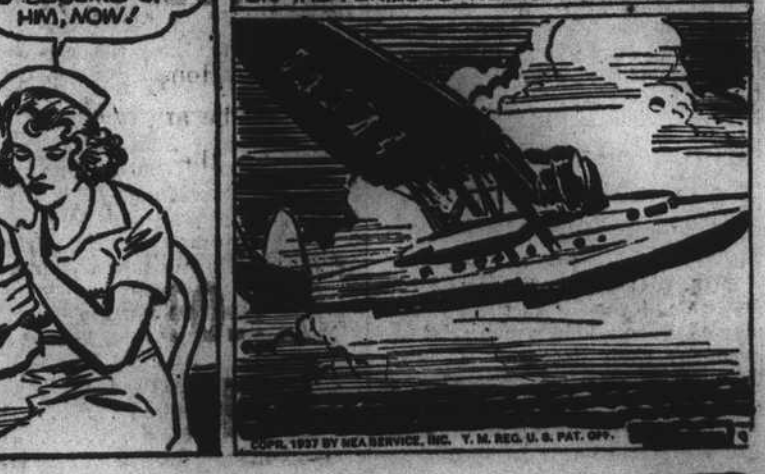
AT THAT MOMENT, FAR ACROSS THE DARK ATLANTIC, A GIANT PLANE STARTS ON THE PERILOUS WESTERN CROSSING.