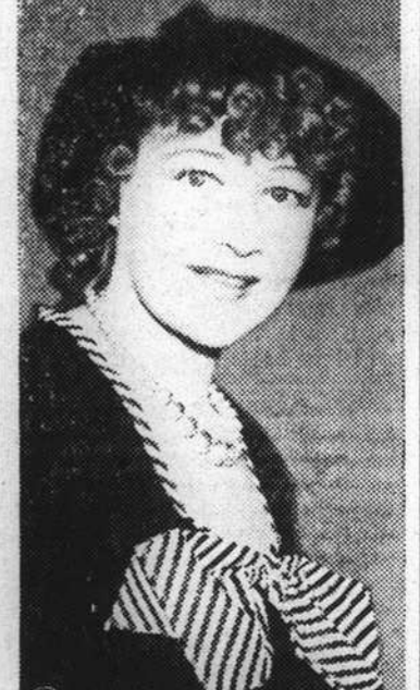
One of the screen's most popular actresses before a fall from a horse made her an invalid for nine years, Anna Q. Nilsson was starting on her own "road back" as this picture was taken of the blond film player reporting for a role in a short subject. Proudest is Anna of her recovery after doctors told her she could never walk again.