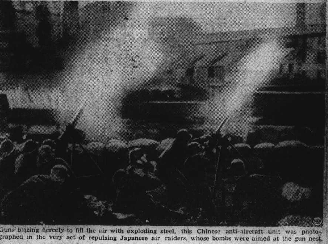
Gun blazing fiercely to fill the air with exploding steel, this Chinese anti-aircraft unit was photographed in the very act of repulsing Japanese air raiders, whose bombs were aimed at the gun nest.

Filling the Air With Steel to Repulse Air Raiders