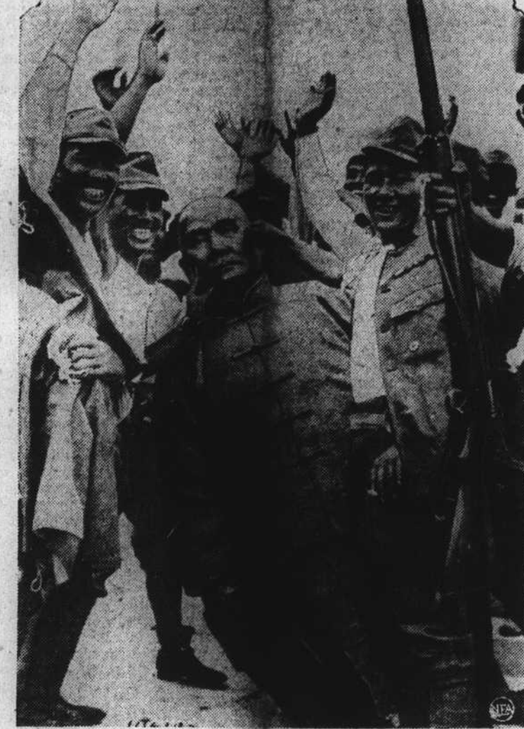
The Sunset of Sun Yat-Sen

Should anyone despoil the statue of one of their heroes, these same Japanese soldiers who take such delight in the ignominy heaped on the figure of Sun Yat-Sen would be up in arms.