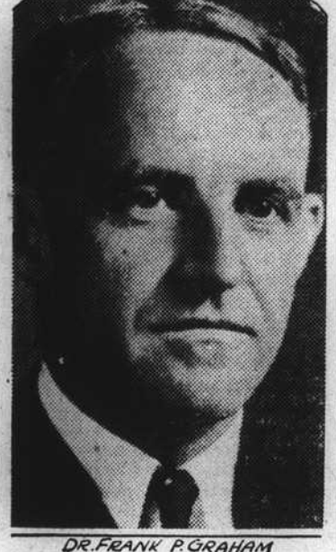
DR. FRANK P. GRAHAM