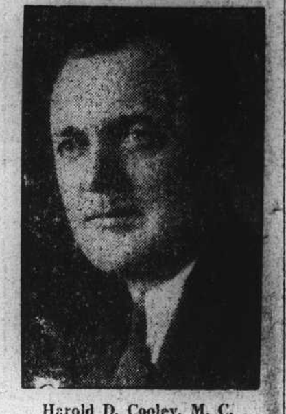
Harold D. Cooley, M. C. Harold Cooley At M. E. Church Today