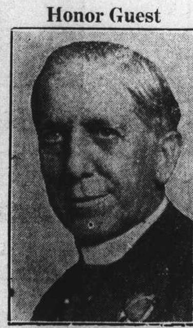
Clyde R. Hoey North Carolina's Governor addressed a gathering of state and division highway engineers at the Ashlyn hotel.

Washington, Dec. 18.—(AP)—The power commission dispute with the Carolina Aluminum company and the state of North Carolina over the navigability of the Yadkin river took a new turn today.