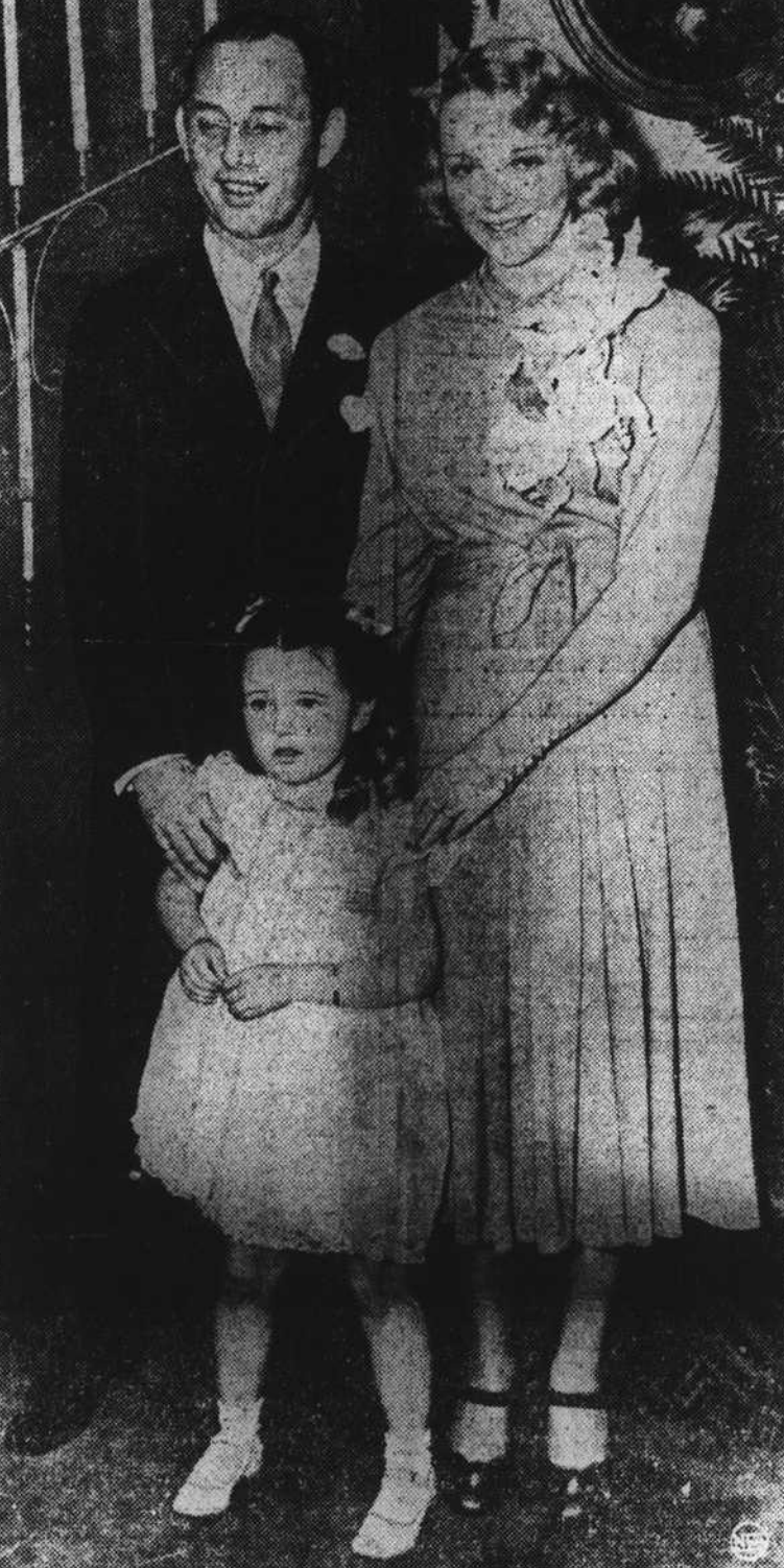
The latest star and movie director to merge their domestic interests are glamorous Virginia Bruce and successful J. Walter Ruben...

Capitol Believes Investigation May Develop A Major Situation