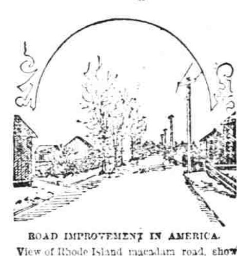
ROAD IMPROVEMENT IN AMERICA.

How to Make a Lasting Road from Common Ordinary Clay. The roadbed through a wet and swampy country, and where the surface of the road is below the land on each side, will become wet from the moisture which soaks up from the bottom.