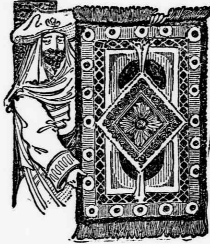
Carpets, Rugs, Etc.