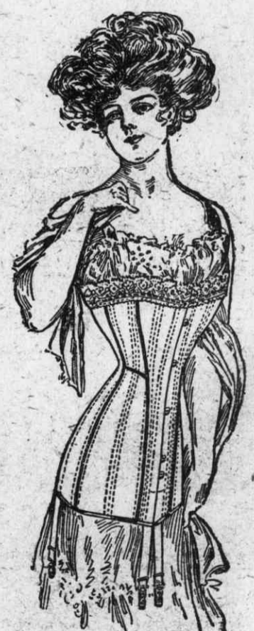
AMERICAN BEAUTY Style 1326 Kalamazoo Corset Co., Makers