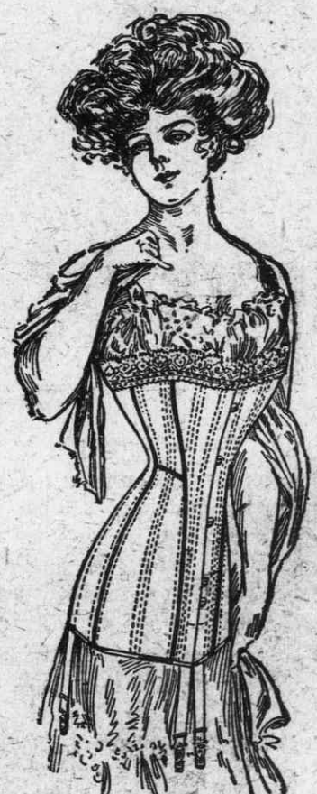
AMERICAN BEAUTY Style 1325 Kalamazoo Corset Co., Makers