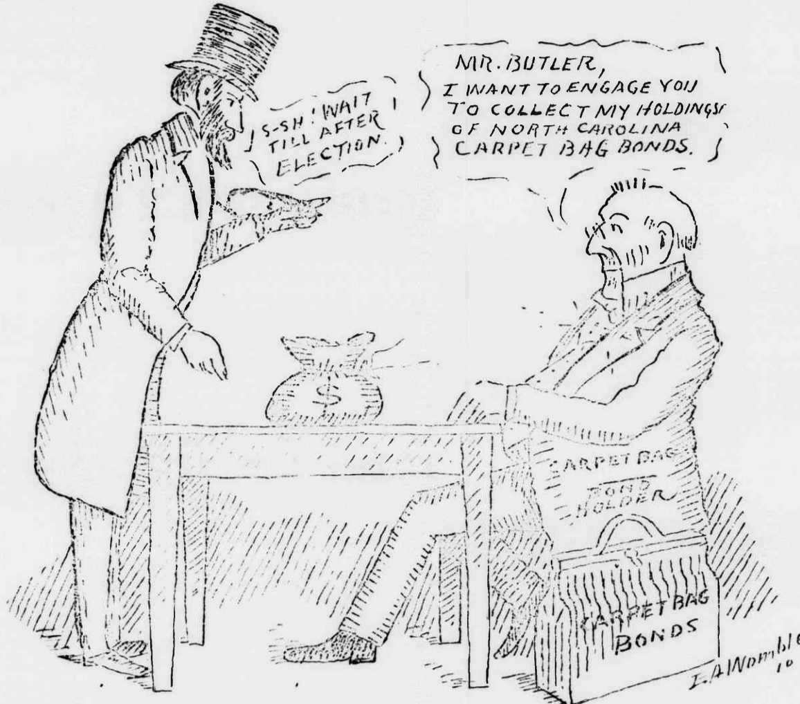
THE PARAMOUNT ISSUE IN NORTH CAROLINA

Vote out all crooks, all bosses, all agents of special interests, all stand-