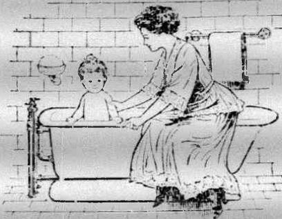
"Standard" "Occident" Bath

height closet for the children and child's bath for the baby. For the latest and best in plumbing fixtures as well as the best workmanship, consult us. No charge for estimates.