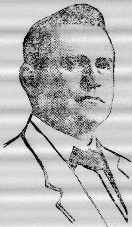
GILLIAM GRISSOM Greensboro, N. C. Republican Candidate for Congress from the 5th District.