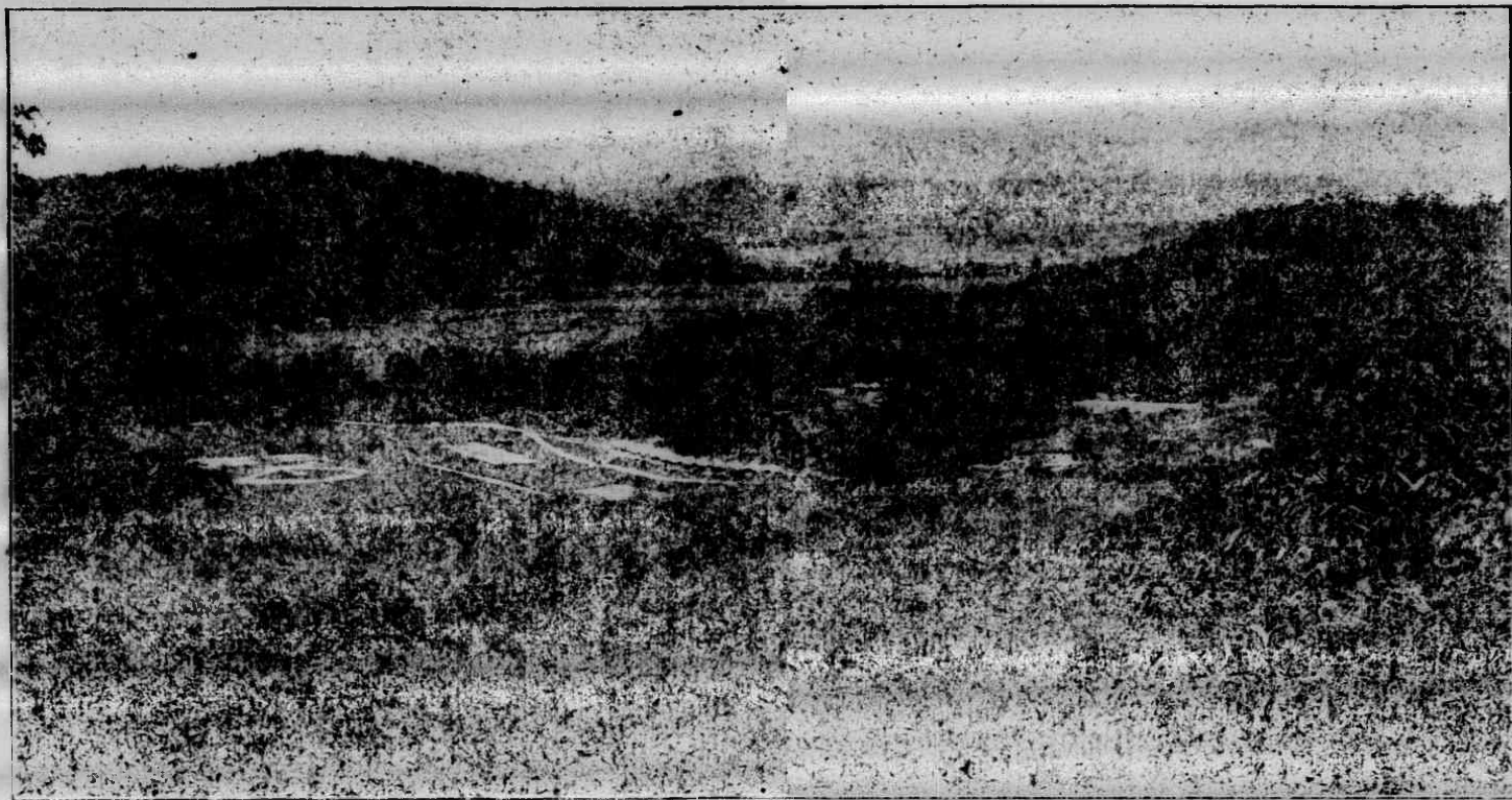
THE FRENCH BROAD CAMP